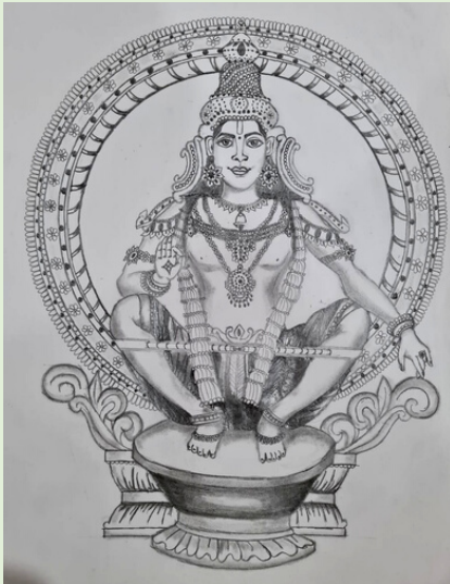
Free hand drawing by by Radhika Athota